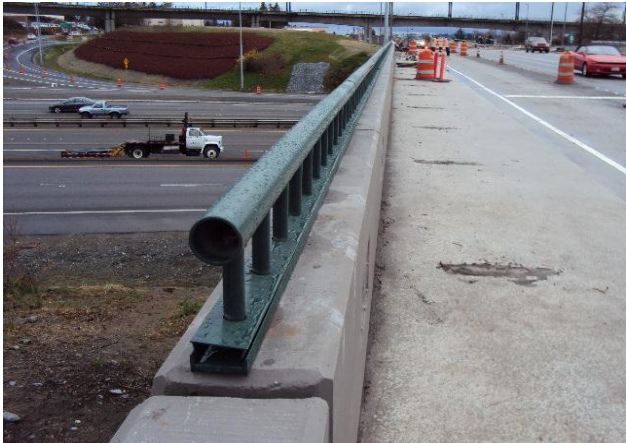
Handrail installed at SR 99 Bridge widening