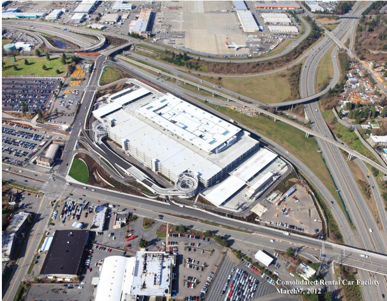
Consolidated Rental Car Facility March 7, 2012