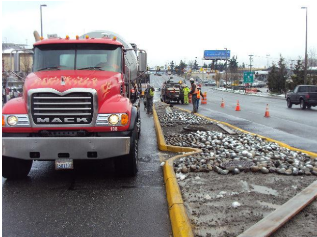
New hardscape at International Blvd. medians