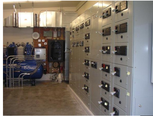
CNG Control Room