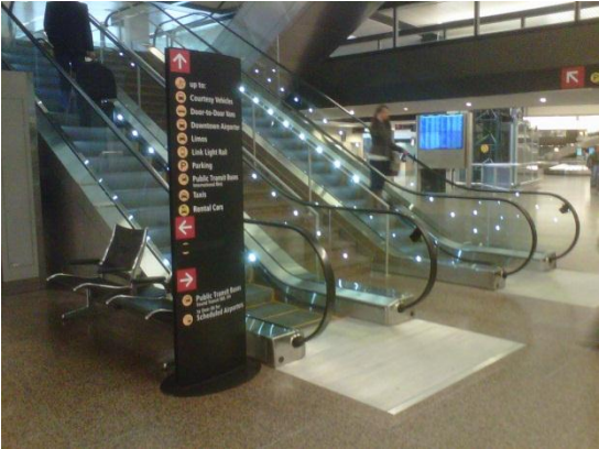
New standing sign faces for Shuttle Buses