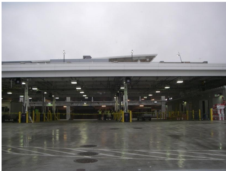
Fuel Pump Startup in QTA #2