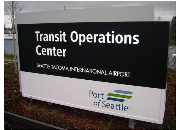
...the new Transit Operations Center