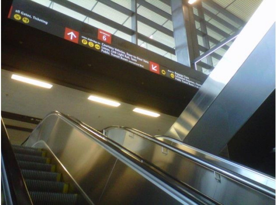
New sign faces at skybridges for Shuttle Buses