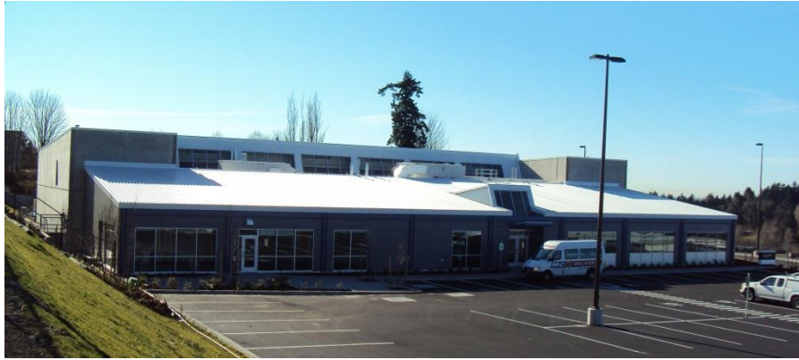
Bus Maintenance Building becoming...