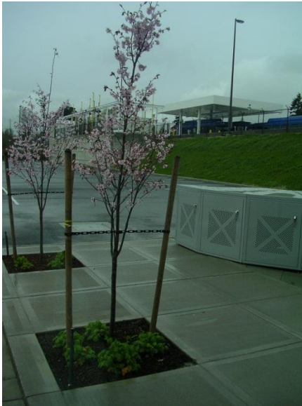
April showers & May flowers