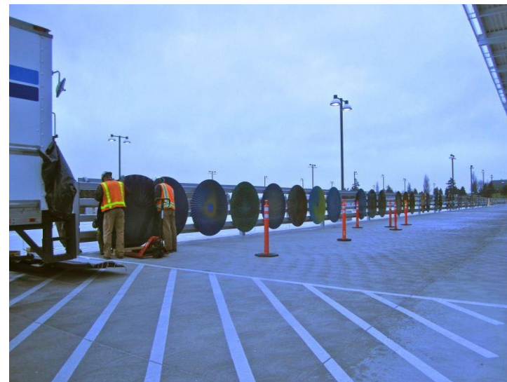
RCF Spinning discs