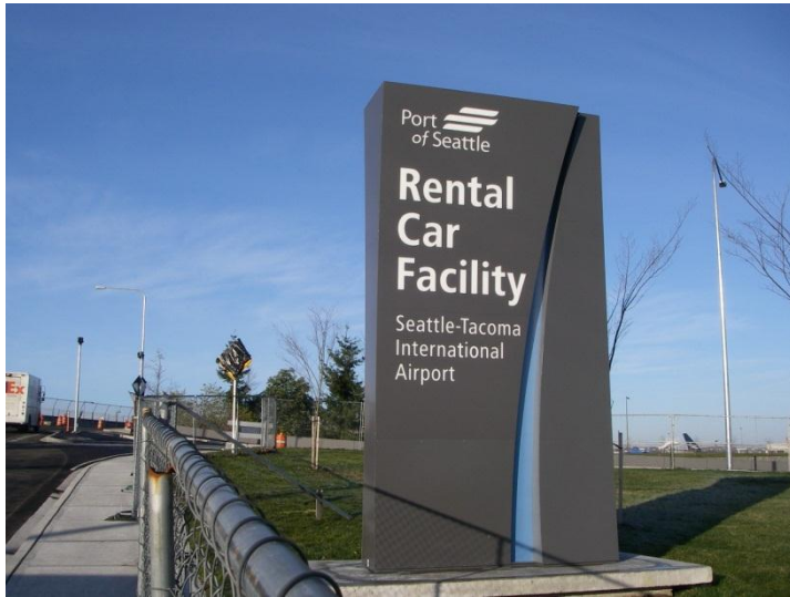
RCF Bridge 4 Approach Sign